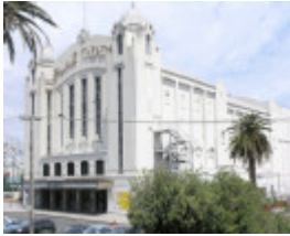
PALAIS THEATRE SOHE 2008