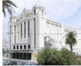
PALAIS THEATRE SOHE 2008