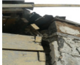
Woodbourne Homestead Meredith detail of 1840s and 60s section