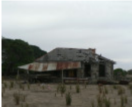
Woodbourne Homestead Meredith 1860s section