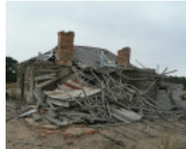
Woodbourne Homestead Meredith 1840s section at rear