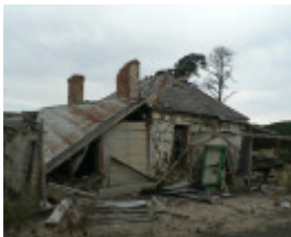
Woodbourne Homestead Meredith 1840s section