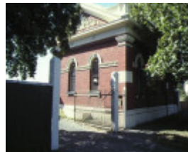
h00675 former gas valve house st kilda road st kilda front gates mar1979