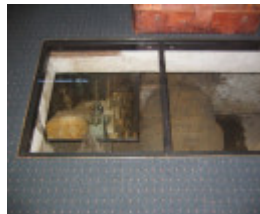
h00675 former gas valve house st kilda road st kilda gas valve she project 2004