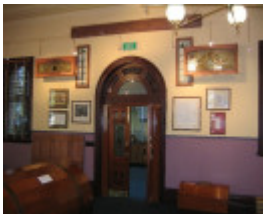
h00675 former gas valve house st kilda road st kilda entrance she project 2004