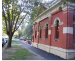
h00675 former gas valve house st kilda road st kilda along street she project 2004