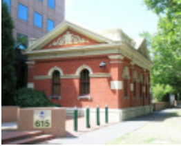
FORMER GAS VALVE HOUSE SOHE 2008