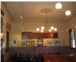
h00675 former gas valve house st kilda road st kilda inside ceiling she project 2004