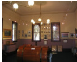
h00675 former gas valve house st kilda road st kilda interior view she project 2004