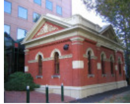
h00675 1 former gas valve house st kilda road st kilda street view she project 2004