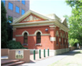
FORMER GAS VALVE HOUSE SOHE 2008