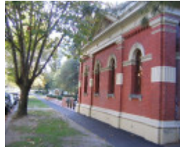
h00675 former gas valve house st kilda road st kilda along street she project 2004