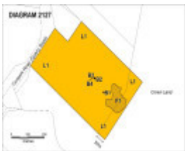
PROV H2127 workshed