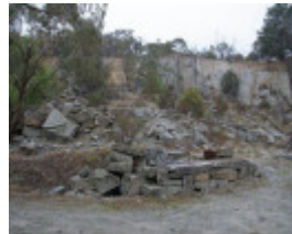
PROV H2127 IMG 9033