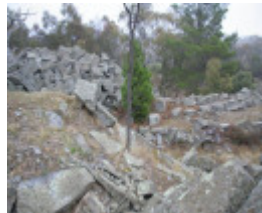
PROV H2127 IMG 9061