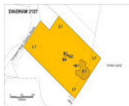
PROV H2127 workshed