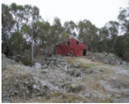
PROV H2127 workshed