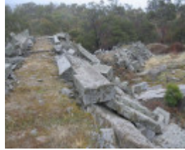
PROV H2127 IMG 9007