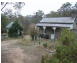
PROV H2127 Granite Cottage