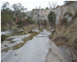
PROV H2127 IMG 9028