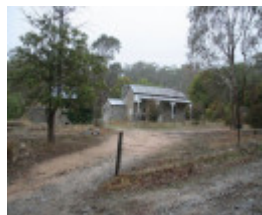
PROV H2127 Granite Cottage