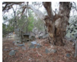
PROV H2127 IMG 9083