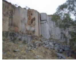
PROV H2127 IMG 8988