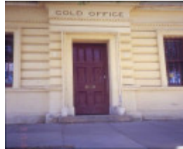
h00349 former westpac now bank of melbourne ford street beechworth gold office door she project 2003