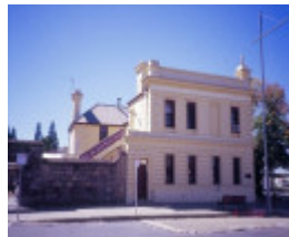
h00349 former westpac now bank of melbourne ford street beechworth camp st facade she project 2003