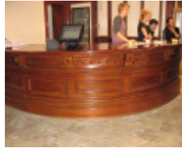
Former Bank of NSW bank counter