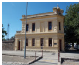
Bank of NSW south side wall