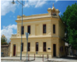
BEECHWORTH WINE CENTRE SOHE 2008