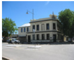
Former Bank of NSW