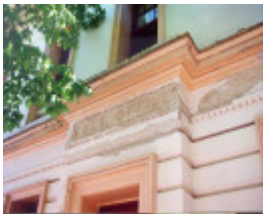
former bank of nsw beechworth facade detail 1995