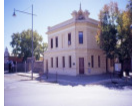
h00349 1 former westpac now bank of melbourne ford street beechworth corner facade she project 2003