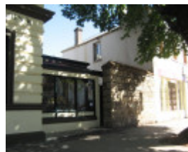
Former Bank of NSW north wall