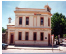
former bank of nsw beechworth front view 1995