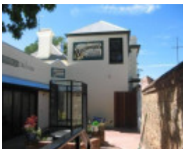
Former Bank of NSW 18 Nov 2014 (25) rear addition