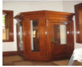
Former Bank of NSW timber entry vestibule