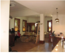
Former Bank of NSW ground floor interior