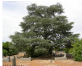
PROV H2215 Beechworth Cemetery Blue atlas cedar