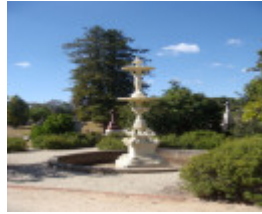
PROV H2215 Beechworth Cemetery fountain