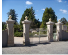
PROV H2215 Beechworth Cemetery main entrance gates