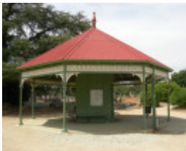
PROV H2215 Beechworth Cemetery rotunda