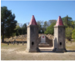
PROV H2215 Beechworth Cemetery chinese towers & altar