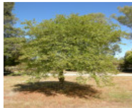
PROV H2215 beechworth Cemetery rare viburnum obovatum