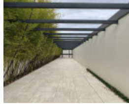
2021 Seccull House