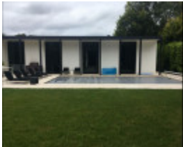
2021 Seccull House 2