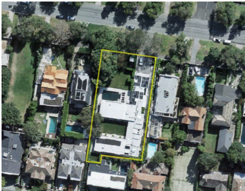
Secull House - aerial diagram