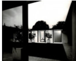
c1972 Seccull family Bell