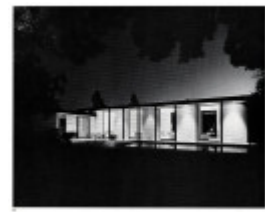
c1972 Architecture of Guilford Bell