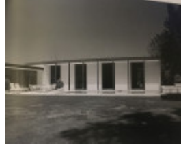
c1972 Seccull House - The Lifework of Guilford Bell