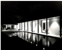
c1972 - Seccull family