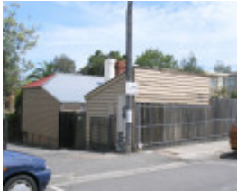
RESIDENCE SOHE 2008