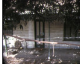
1 residence waterloo crescent st kilda front view