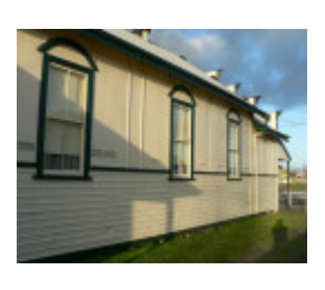
Globe Theatre, Winchelsea side view 2009