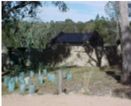
powder magazine skidmore road beechworth