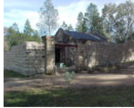
1 powder magazine skidmore road beechworth