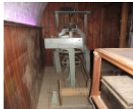
Fuze spinning machine