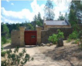
POWDER MAGAZINE SOHE 2008