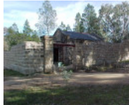
1 powder magazine skidmore road beechworth