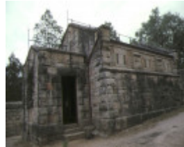
powder magazine skidmore road beechworth entrance