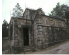
powder magazine skidmore road beechworth entrance