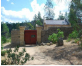
POWDER MAGAZINE SOHE 2008