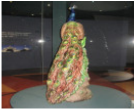
Loch Ard Peacock rear view