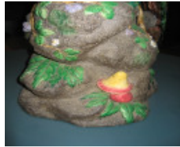
Loch Ard Peacock close up of base