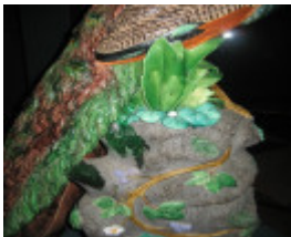
Loch Ard Peacock close up of foliage