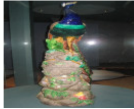
Loch Ard Peacock front view