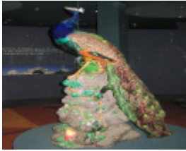
Loch Ard Peacock side view