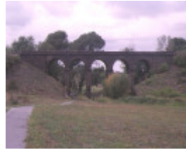
1 rail bridge over kismet creek sunbury side view jun1984