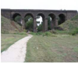
RAIL BRIDGE SOHE 2008