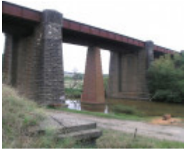
RAIL BRIDGE SOHE 2008