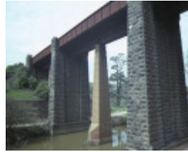
1 rail bridge over jackson's creek sunbury side elevation sep 84