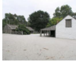
EMU BOTTOM SOHE 2008