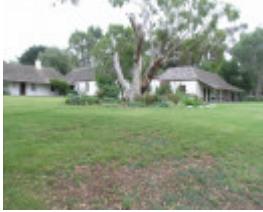
EMU BOTTOM SOHE 2008