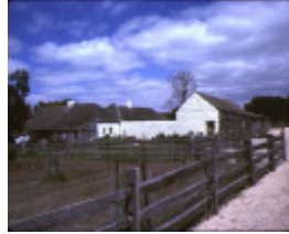
1 emu bottom racecourse road sunbury side view with fencing