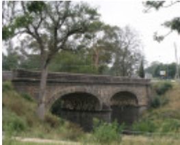
BRIDGE SOHE 2008