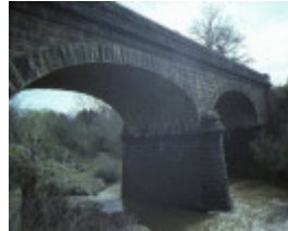
1 bridge over jackson's creek sunbury side view sep1984