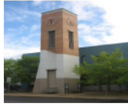
Massey Ferguson Complex_Sunshine_Clock Tower_Sept 2007