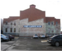
Massey Ferguson Complex_Sunshine_Stores Building_Sept 2007_02