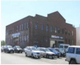
MASSEY FERGUSON COMPLEX SOHE 2008