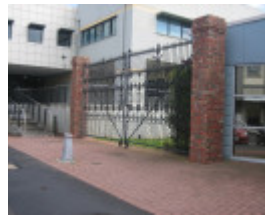
Massey Ferguson Complex_Sunshine_Gates_Se 2007