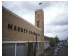
former massey ferguson complex devonshire road sunshine office & clock tower dec1985