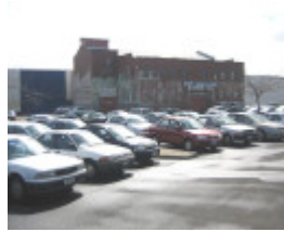
Massey Ferguson Complex_Sunshine_Stores Building_Sept 2007_01