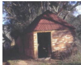
chateau tahbilk tabilk rd tabilk blacksmith shop she project 2003