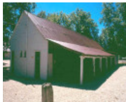
h00296 h296 chateau tahbilk workshop