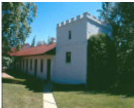
h00296 h296 chateau tahbilk winery jan 2004