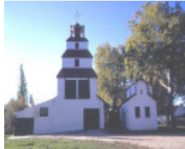
h00296 1 chateau tahbilk tabilk rd tabilk tower and still house she project 2003