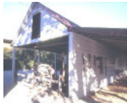
chateau tahbilk tabilk rd tabilk cartshed she project 2003