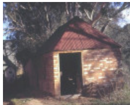
chateau tahbilk tabilk rd tabilk blacksmith shop she project 2003