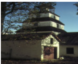
Chateau Tahbilk View of Tower.