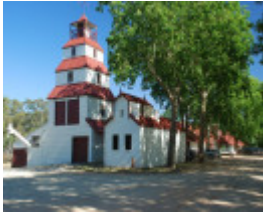
CHATEAU TAHBILK SOHE 2008