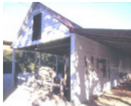
chateau tahbilk tabilk rd tabilk cartshed she project 2003