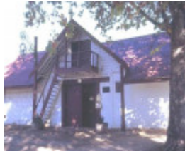
chateau tahbilk tabilk rd tabilk winery she project 2003