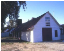
chateau tahbilk tabilk rd tabilk cellar entrance she project 2003