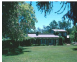
h00296 h296 chateau tahbilk house