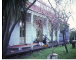
1 woodcot park tannery road tarraville front view oct1984