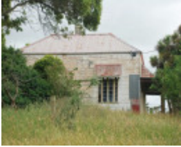
WOODCOT PARK SOHE 2008