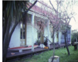
1 woodcot park tannery road tarraville front view oct1984