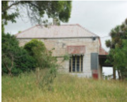
WOODCOT PARK SOHE 2008