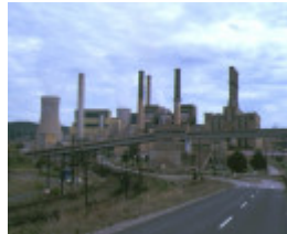
1 yallourn a b c d & e power stations latrobe valley yallourn property view