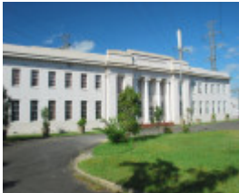
FORMER YALLOURN POWER STATION ADMINISTRATIVE BUILDING SOHE 2008