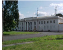
1 former yallourn power station administrative building