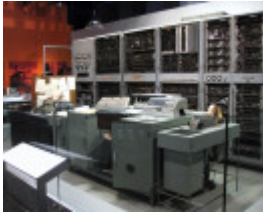
PROV H2217 CSIRAC on display