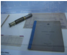
PROV H2217 CSIRAC material on display including slide rule and M. Beard publication