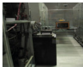
PROV H2217 CSIRAC side view rear of computer cabinets