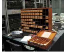
PROV H2217 CSIRAC paper tape and boxes close up