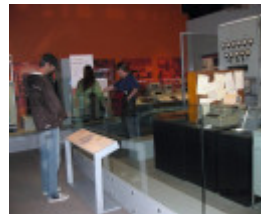
PROV H2217 CSIRAC display with visitors