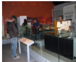
PROV H2217 CSIRAC display with visitors