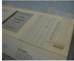
PROV H2217 CSIRAC material on display including Interprogram Manual