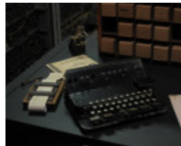
PROV H2217 CSIRAC close up of paper tape punch machine and tape holder