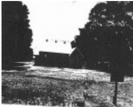
St George's Balliang Anglican Church