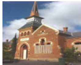
h01718 beechworth primary school junction road beechworth front she project 2004