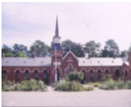
beechworth primary school no 1560 junction road beechworth front elevation mar1998