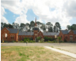
BEECHWORTH PRIMARY SCHOOL NO. 1560 SOHE 2008