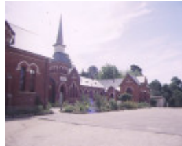
1 beechworth primary school no 1560 junction road beechworth front view mar1998