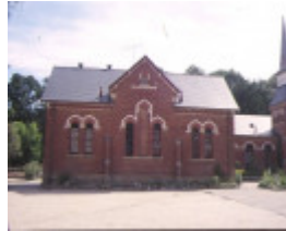
beechworth primary school no 1560 junction road beechworth front detail mar1998