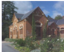
h01718 beechworth primary school junction road beechworth side detail she project 2004