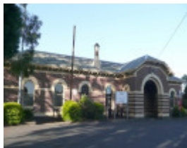
TERANG RAILWAY STATION SOHE 2008