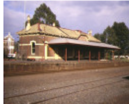
1 terang railway station terang trackside view may1995