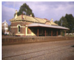
1 terang railway station terang trackside view may1995