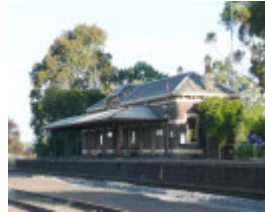
TERANG RAILWAY STATION SOHE 2008