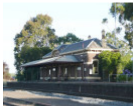
TERANG RAILWAY STATION SOHE 2008