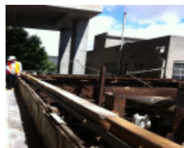
remedial works commence Nov 2011