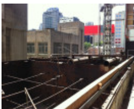
Internal tie rods