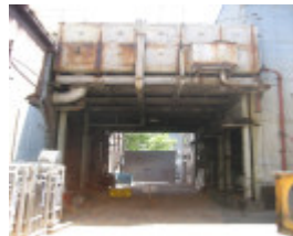
H2117 Overhead Water Tank Spencer St Power Station Rear View 6 Dec 2006 mz