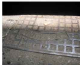
H2117 Overhead Water Tank Spencer St Power Station Hydraulic Valve Cover Plate 6 Dec 2006 mz