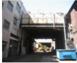
H2117 Overhead Water Tank Spencer St Power Station Front View 6 Dec 2006 mz