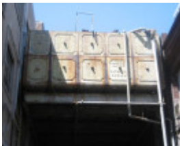
H2117 Overhead Water Tank Spencer St Power Station Front View Detail 6 Dec 2006 mz