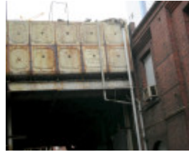
OVERHEAD WATER TANK SOHE 2008