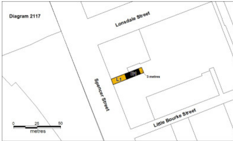
H2117 Overhead Water Tank Lonsdale St Power Station Plan Jan 2007 mz