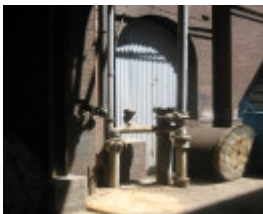
H2117 Overhead Water Tank Spencer St Power Station Associated Pipework 6 Dec 2006 mz