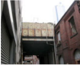
OVERHEAD WATER TANK SOHE 2008