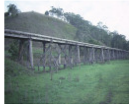
1 rail bridge curdies river timboon side view jun1984