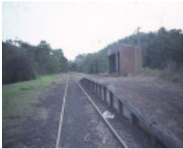
rail bridge curdies river timboon curdies siding jun1984