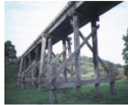
rail bridge curdies river timboon trestle detail jun1984