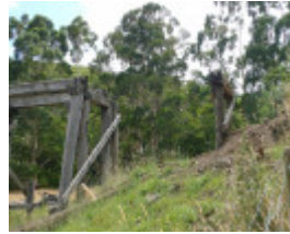
RAIL BRIDGE SOHE 2008