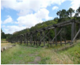
RAIL BRIDGE SOHE 2008