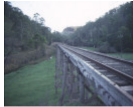
rail bridge curdies river timboon rail tracks jun1984