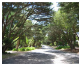
h01605 1 ranelagh estate wimbledon avenue