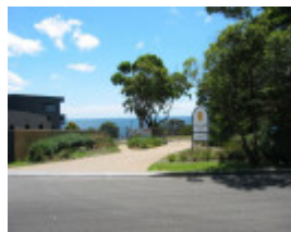
h01605 ranelagh estate ranelagh club