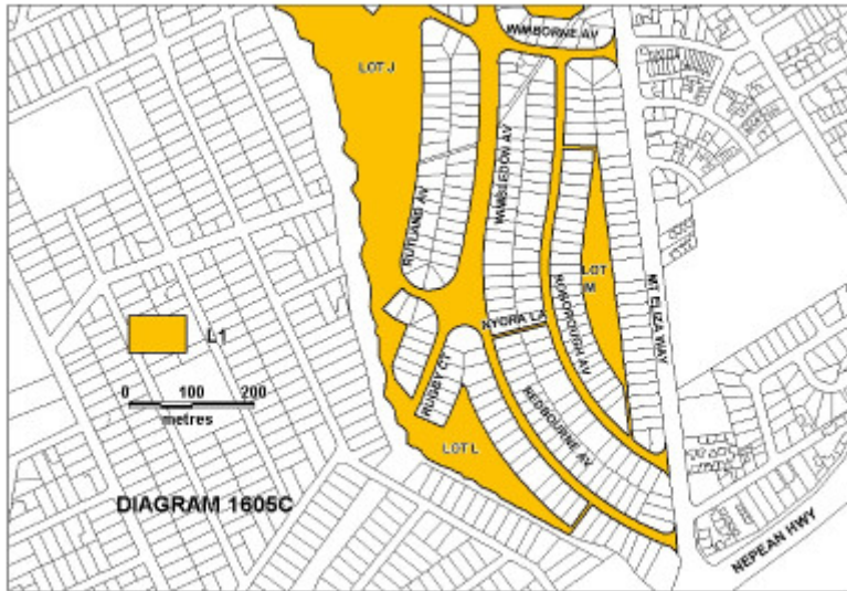
h01605 ranelagh estate plan