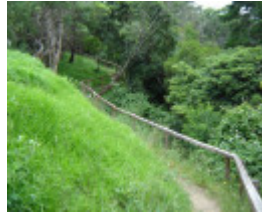
h01605 ranelagh estate mt eliza earimil walk