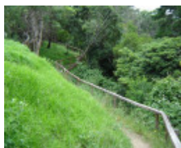
h01605 ranelagh estate mt eliza earimil walk