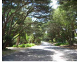
h01605 1 ranelagh estate wimbledon avenue