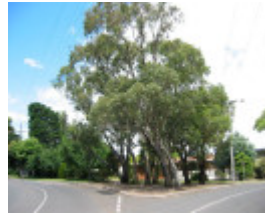
h01605 ranelagh estate traffic island