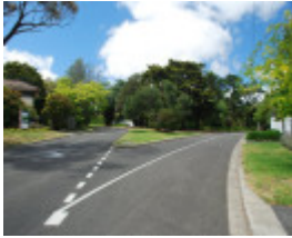
RANELAGH ESTATE SOHE 2008