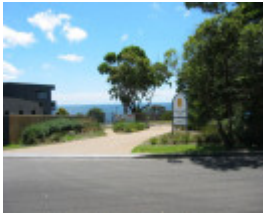
h01605 ranelagh estate ranelagh club