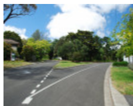
RANELAGH ESTATE SOHE 2008