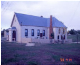
h00544 mechanics institute free library king and cowan street toongabbie south west view she project 2003