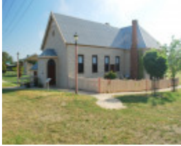
MECHANICS INSTITUTE AND FREE LIBRARY SOHE 2008