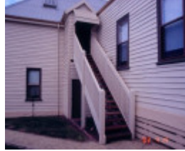
h00544 mechanics institute free library king and cowan street toongabbie exterior stair well she project 2003