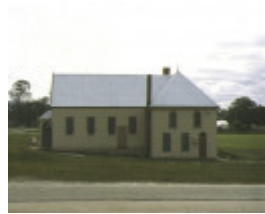
h00544 mechanics institute free library toongabbie front view aug1992