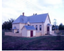
h00544 1 mechanics institute free library king and cowan street toongabbie north west view she project 2003