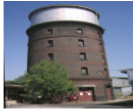
Former Railway Workshops Champion Road Newport Water Tower Feb 1994