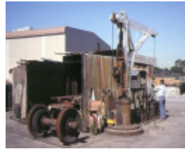
Former Railway Workshops Champion Road Newport Hydraulic Crane