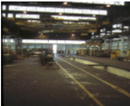
Former Railway Workshops Champion Road Newport Workshop Interior