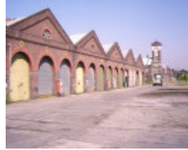
1 former railway workshops champion road newport east block of workshops feb1994