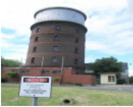
FORMER NEWPORT RAILWAY WORKSHOPS SOHE 2008