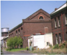
Former Railway Workshops Champion Road Newport Central Store Feb 1994