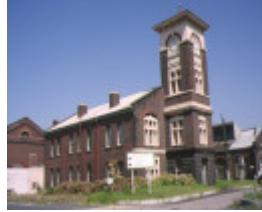
Former Railway Workshops Champion Road Newport Central Offices & Clock Tower