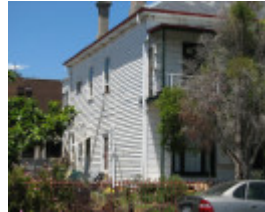
ARUNDEL SOHE 2008