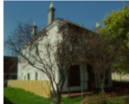
1 arundel ross street coburg front 2001