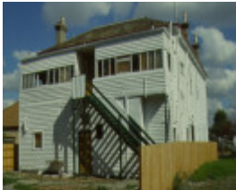
Arundel Ross Street Coburg Rear 2001