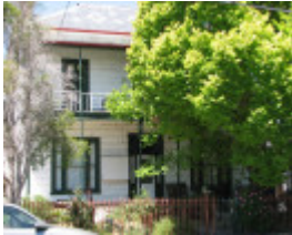
ARUNDEL SOHE 2008