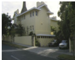
1 clendon lodge clendon rd toorak view from street feb1986