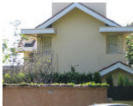
CLENDON LODGE SOHE 2008