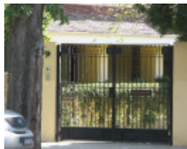
CLENDON LODGE SOHE 2008