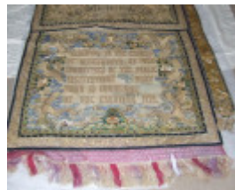
Large banner- detail