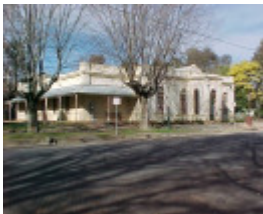
burke museum loch street beechworth front view july 1999