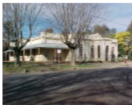
burke museum loch street beechworth front view july 1999