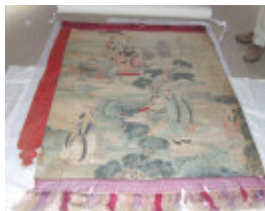
Large banner reverse