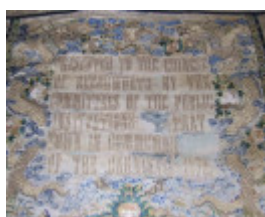
Chinese banner detail 4