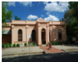
BURKE MUSEUM SOHE 2008