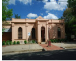
BURKE MUSEUM SOHE 2008