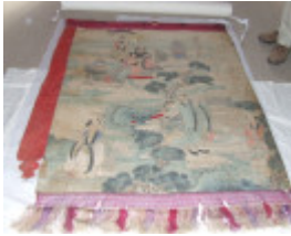
Large banner reverse