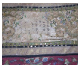
Chines banner detail 2