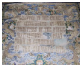
Chinese banner detail 4