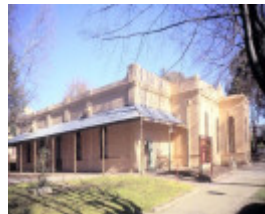
burke museum loch st beechworth view 1976 addition she project 2003