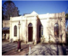
h00345 1 burke museum loch st beechworth elevation loch street she project 2003