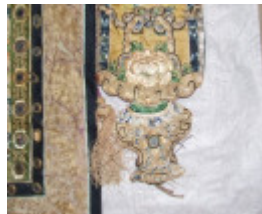
Chinese Banner Detail