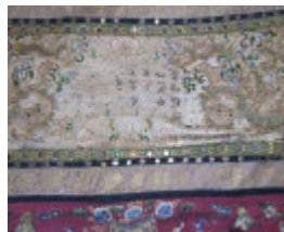
Chines banner detail 2