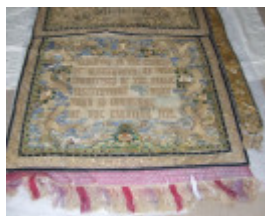
Large banner- detail