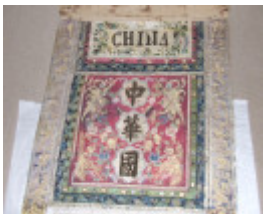
Banner- Full detail