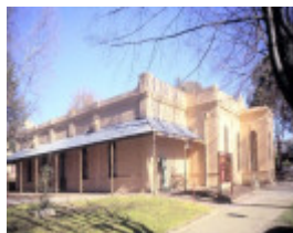
burke museum loch st beechworth view 1976 addition she project 2003