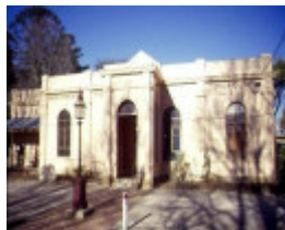
h00345 1 burke museum loch st beechworth elevation loch street she project 2003