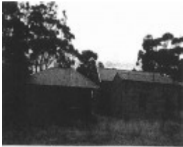
Former School & Mechanics Institute