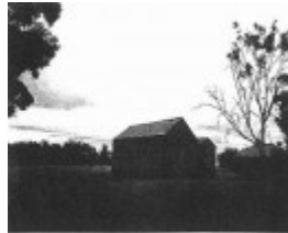
Former School & Mechanics Institute