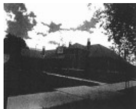
Bacchus Marsh Secondary College. Maddingley Campus