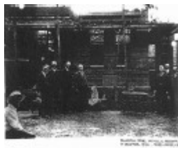
Bacchus Marsh Secondary College. Maddingley Campus