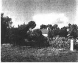
House, Browns Lane