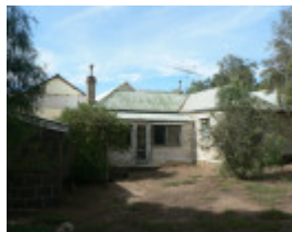
116813 1754 Hamilton Hwy Murgheboluc Butleigh 523