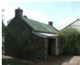
116813 1754 Hamilton Hwy Murgheboluc Butleigh 524