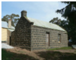
1754 Hamilton Hwy Murgheboluc Butleigh, bluestone section.