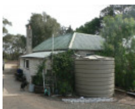
116813 1754 Hamilton Hwy Murgheboluc Butleigh 527