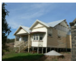
116813 1754 Hamilton Hwy Murgheboluc Butleigh 521