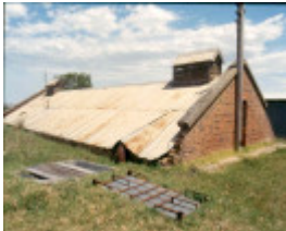
h02040 bairnsdale pumping station 1888 brick tank