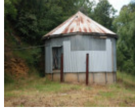
BAIRNSDALE PUMPING STATION SOHE 2008