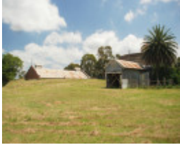
BAIRNSDALE PUMPING STATION SOHE 2008