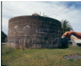
h02040 bairnsdale pumping station monier 1906 tank