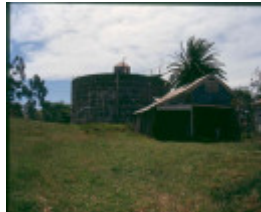
h02040 bairnsdale pumping station 2002