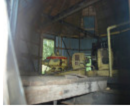
BAIRNSDALE PUMPING STATION SOHE 2008