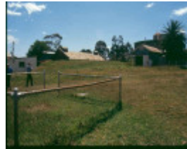
h02040 bairnsdale pumping station 2 2002