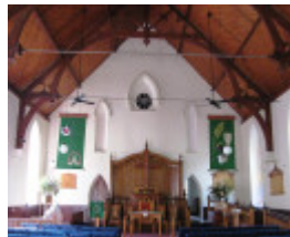
St Andrews interior