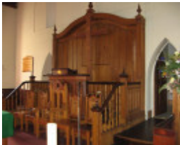
St Andrews interior