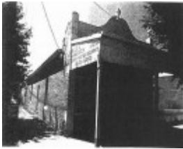
Seery & Associates Certified Practising Accountants.