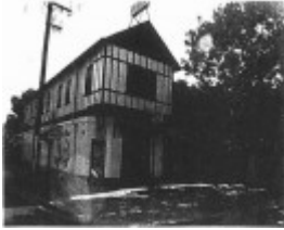
The Border Inn