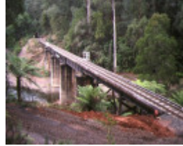
1 rail bridge thomson river walhalla end view apr1995