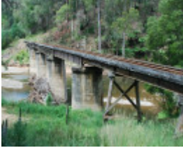
RAIL BRIDGE SOHE 2008