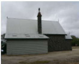
West elevation, Former State School, Murgheboluc