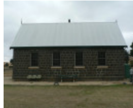
East elevation, Former State School, Murgheboluc