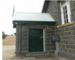
Entrance Porch, Former State School, Murgheboluc