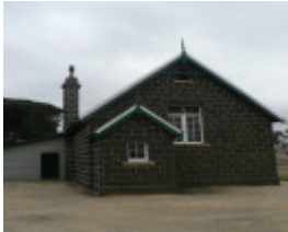
Former State School, now Public Hall, Murgheboluc