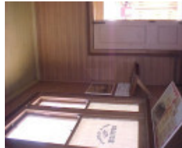
Walhalla Post Office Interior March 2003