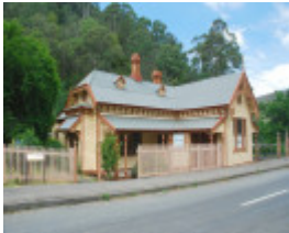
FORMER WALHALLA POST OFFICE AND RESIDENCE SOHE 2008