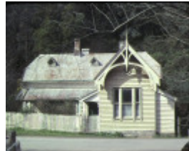
H00583 former walhalla post office walhalla front view sep1982