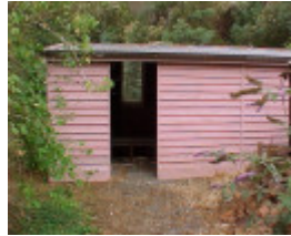
Walhalla Post Office Exterior Outbuilding March 2003