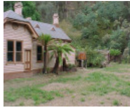
H00583 walhalla po exterior7 mar 2003