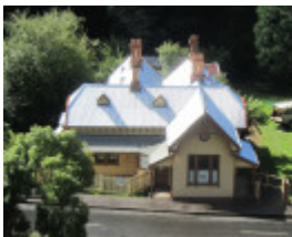
After Photograph - Reference F3834 2016