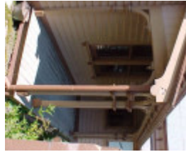
Walhalla Post Office Exterior Verandah March 2003