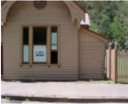
Walhalla Post Office Exterior March 2003