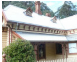
After Photograph - Reference F3834 2016