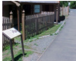
H00583 walhalla po exterior interp board mar 2003