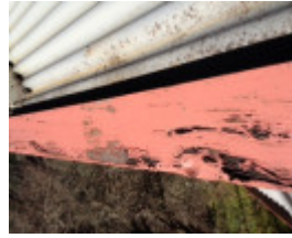
Before Photograph - Reference F3834 2014