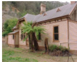
H00583 walhalla po exterior side mar 2003