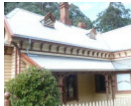
After Photograph - Reference F3834 2016