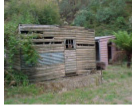
Walhalla Post Office Exterior Outbuildings March 2003