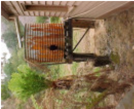
Walhalla Post Office Exterior Water Tank March 2003