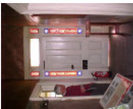
Walhalla Post Office Interior March 2003