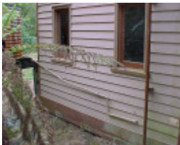
H00583 walhalla po exterior openings mar 2003