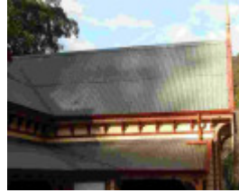
Before Photograph - Reference F3834 2014