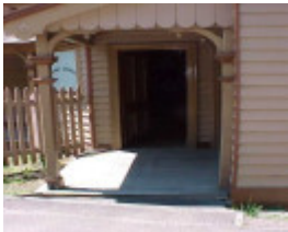
H00583 walhalla po exterior doorway mar 2003