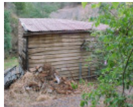
H00583 walhalla po exterior outbuilding mar 2003