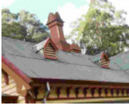
Before Photograph - Reference F3834 2014