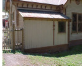
Walhalla Post Office Exterior March 2003