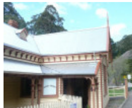
After Photograph - Reference F3834 2016