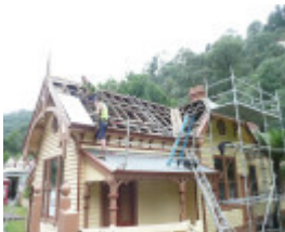
During Photograph - Reference F3834 2015