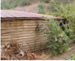
Walhalla Post Office Exterior Outbuilding March 2003