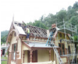
During Photograph - Reference F3834 2015