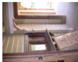
H00583 walhalla po exterior verandah2 mar 2003