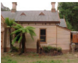
H00583 walhalla po exterior side2 mar 2003