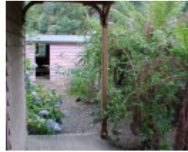
Walhalla Post Office Exterior Verandah March 2003