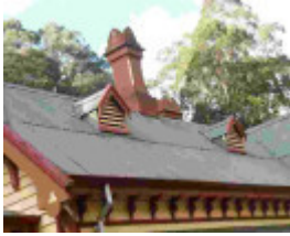
Before Photograph - Reference F3834 2014