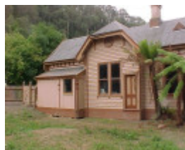
H00583 walhalla po exterior3 mar 2003