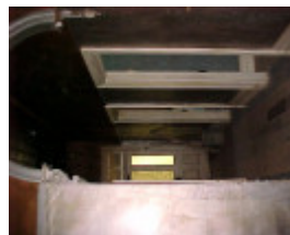
Walhalla Post Office Interior Hallway March 2003