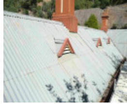
Before Photograph - Reference F3834 2014