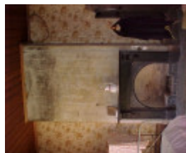
Walhalla Post Office Interior Wallpapers March 2003