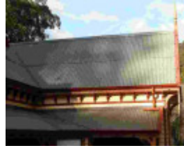
Before Photograph - Reference F3834 2014