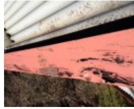
Before Photograph - Reference F3834 2014