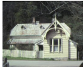
H00583 former walhalla post office walhalla front view sep1982