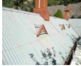
Before Photograph - Reference F3834 2014