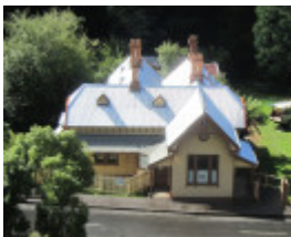
After Photograph - Reference F3834 2016