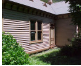
Walhalla Post Office Exterior Side March 2003