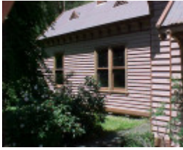
Walhalla Post Office Exterior Side March 2003