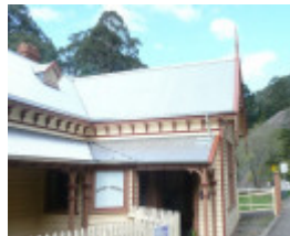
After Photograph - Reference F3834 2016