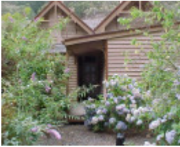
Walhalla Post Office Exterior Twin Gables March 2003