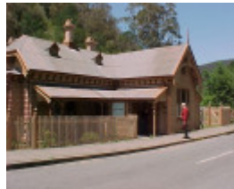
H00583 1 walhalla po exterior mar 2003