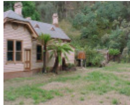
H00583 walhalla po exterior7 mar 2003