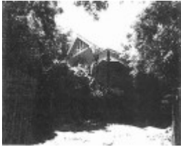
House, 90 Main Street