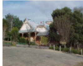
PRIMARY SCHOOL NO. 275 1 wandiligong primary school SOHE 2008 side view2 jun2001 pm1