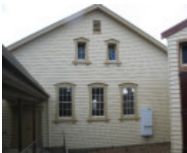
Portland Drill Hall