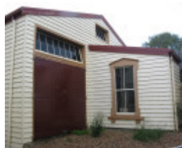
Portland Drill Hall