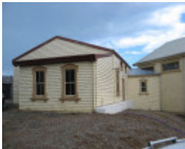
Portland Drill Hall