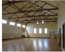
Portland Drill Hall