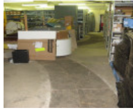
Portland Drill Hall