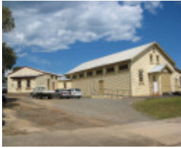
Portland Drill Hall