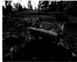
HO246 - Fayrefield Hat Factory, site of former foot bridge over creek