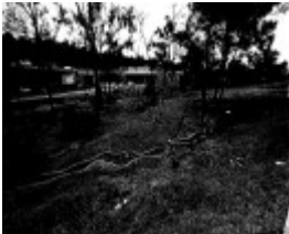
HO246 - curvilinear cascade water channels running through design.