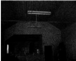
HO239 - Library entry