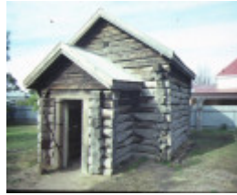
1 lock up devereux street warracknabeal front elevation jul1984