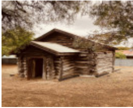
Warrack Lock-up April 2023 1