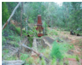
MT HEPBURN COMPANY GOLD TREATMENT WORKS SOHE 2008