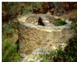
1 mt hepburn treatment works stone pier db