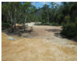
CASSILIS GOLD MINING COMPANY TREATMENT WORKS SOHE 2008