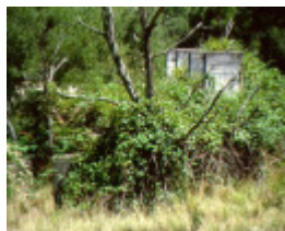
1 cassilis gold treatment works substation db