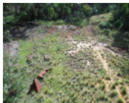
CASSILIS GOLD MINING COMPANY TREATMENT WORKS SOHE 2008